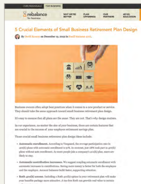
Retirement Plan Design

rebalance360.com/cash-balance-plans-for-businesses